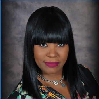
TRACY Leadership Accelerator Graduate

For emerging leaders from Berrien County, this intensive leadership development program is designed as a transformational journey begins with individual development and ends with a focus on community leadership. For ten months, participants meet monthly for full-day workshops that bolster their management abilities, strategic thinking and collaboration. In these workshops, we are developing the next generation of leaders needed to transform Southwest Michigan into a vibrant and prosperous region where all residents have a high quality of life.